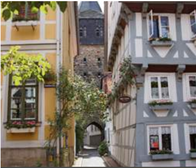
PHOTO BOTTOM 'Kehrwieder' tower in the half-timbered district

There are several caravan and camping sites for motorhomes in Hildesheim and the surrounding region. More information can be found at: www.hildesheim.de/wohnmobil